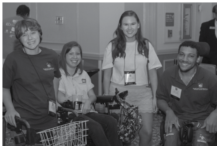
The annual Career Day is an opportunity for participants to learn of many career and education options.