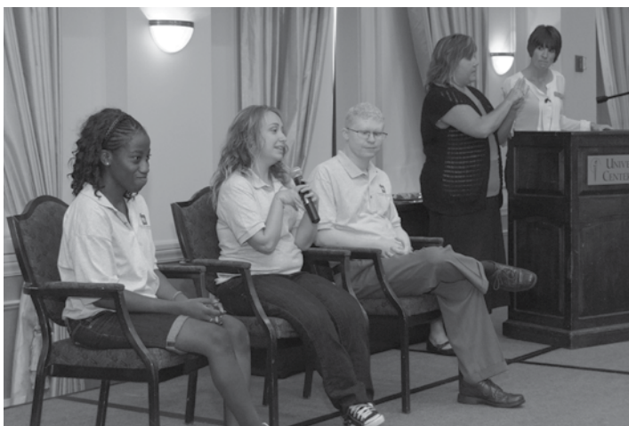
YLF participants exhibit public speaking skills during the annual Mentors luncheon.

If you know of a student that would like to participate, visit www.abletrust.org and select Youth Leadership Forum under the Programs tab to download an application.