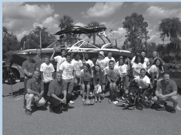
Job-shadowing, industry site visits, mentoring, and internships serve as core features of the Florida HSHT program. (left) Gulf HSHT Students tour TCC Advanced Manufacturing Training Center in Tallahassee. (right) Orange HSHT Students tour Correct Craft Maker in Orlando.