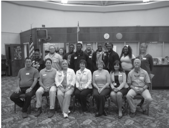
DEAM/DMD participants attend a career fair in Gulf County.

Thanks to the hard work of 80 community liaisons working in 62 of Florida's 67 counties, the 2014 Disability Employment Awareness Month/Disability Mentoring Day (DEAM/DMD) activities held throughout the state were a huge success. Together with more than 150 businesses and organization partners, Florida's DEAM/DMD events provided career exploration opportunities to 2,300 participants.