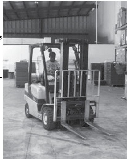
An Okaloosa HSHT student earns his forklift certification.

The Okaloosa HSHT Program is the second site operated by Goodwill Easter Seal of the Gulf Coast, and is serving youth in a Department of Juvenile Justice facility in Crestview, FL. Okaloosa HSHT has served more than 20 youth this year. The program has established relationships with many business and community partners, including North West Florida State College, the National Endowment for Financial Education, McKinnie Masonry, AmeriCorps, CareerSource of Florida, and the Florida Division of Vocational Rehabilitation to provide career training and certifications for the youth prior to program exit. Certifications include forklift operation, oil change technician, basic automotive care, customer service and sales, and supply chain management. Youth participate in a weekly leadership academy that includes goal-setting, financial planning, interpersonal skills, and decision making. ■