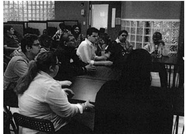
ARC Broward's Center for Financial Stability (CFS) will be able to provide longer term support to their clients – all with disabilities – for a more successful employment outcome.

The Able Trust began the Strategic Employment Placement Grant Program in late 2012, and since then funds have been awarded to Stand Among Friends in Boca Raton, St. Petersburg College Foundation in St. Petersburg, and the Dan Marino Foundation in Ft. Lauderdale. Each of these grantees has embarked on a strategic course to provide career-based employment for individuals, and The Able Trust's investment continues to grow with the 2015 awards to ARC Broward and Tallahassee Community College Foundation. ■