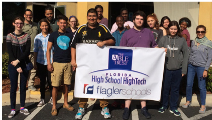
The Able Trust Welcomes The Flagler Schools Foundation to the High School High Tech family.

Core features of the Able Trust HSHT program – job shadowing, industry site visits, mentoring, and internships – are critical components that help students form postsecondary education and employment goals, which are crucial for transition from high school into the world of work. The HSHT program is based on the six nationally recognized, evidenced-based Guideposts for Success: School-Based Preparatory Experiences; Career Preparation & Work-Based Learning; Connecting Activities; Youth Leadership & Development; Family Involvement & Support and Communication Skills. Research has shown that each guidepost is essential to what youth with disabilities need to succeed in adulthood. The Florida HSHT Program operates in 43 sites throughout the state, including two juvenile justice facilities and a foster care site. For more information on the Florida HSHT Program, visit www.abletrust.org .