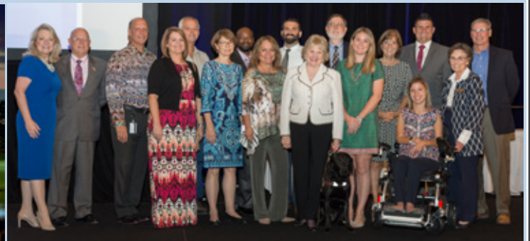
2017 The Able Trust Ability Award Winners